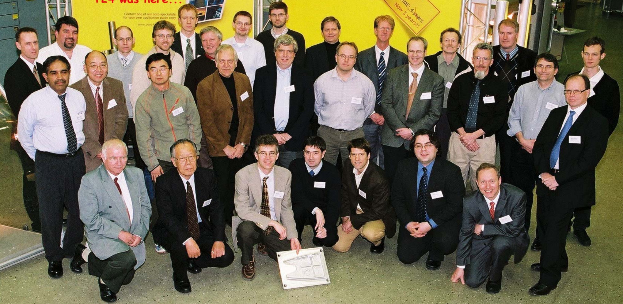
STEP Manufacturing at Sandvik Coromant and Scania, March 10-12th, 2008

SPECIAL! CNC LATHE PAYBACK TIME: 4 years Now 3 years!!